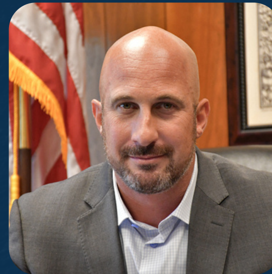
HEATH FLORA DISTRICT 9