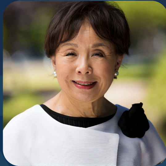
DORIS MATSUI DISTRICT 7