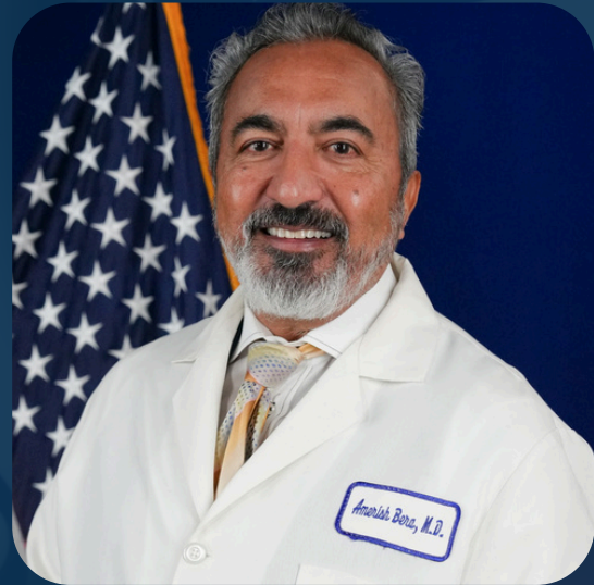
DR. AMI BERA DISTRICT 3